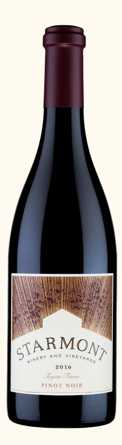
AVA: Composition: Alcohol: TA: pH: Production:

Toyon Farm, Carneros 100% Pinot Noir 14.1% by volume 5.24 g/L 3.85 156 cases